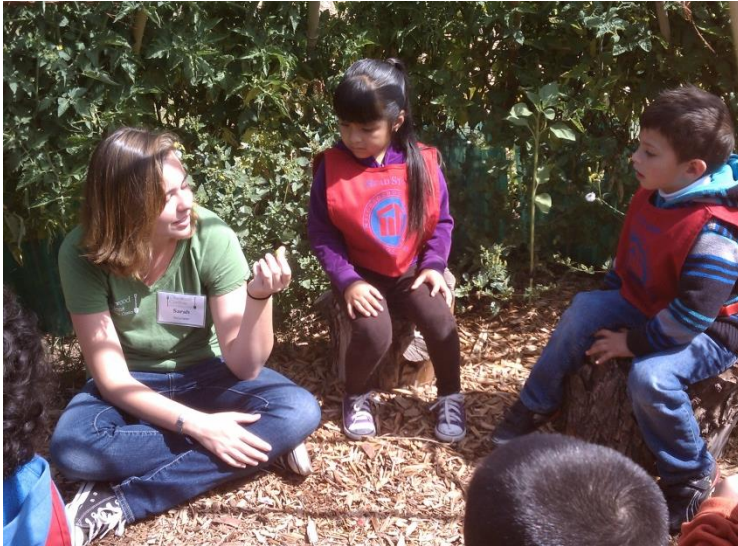
Sweetwater High School student working with Head Start Preschoolers