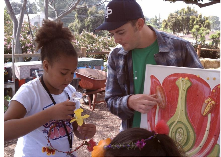
SDSU Public Health Student teaching Science to Girl Scouts

Lasting products gained from interns – lessons on Portion Control, MyPlate dietary guidelines, new recipes, research paper on new food introduction, new waste reduction signage.